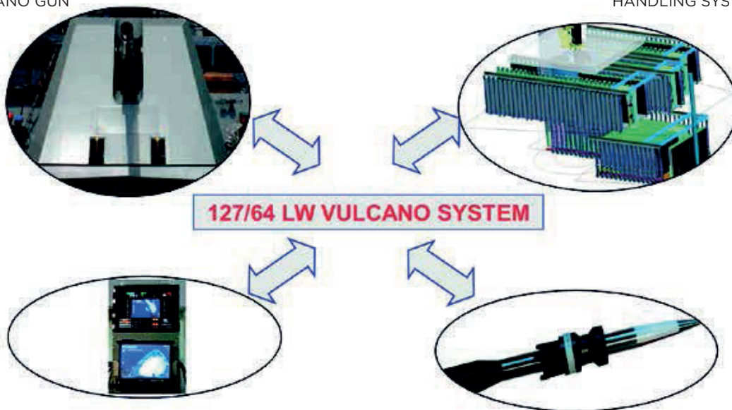
NAVAL FIRE CONTROL SYSTEM (MISSION PLANNING & EXECUTION)