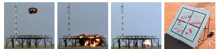
Height of Burst Instantaneous Impact Delayed Impact Accuracy