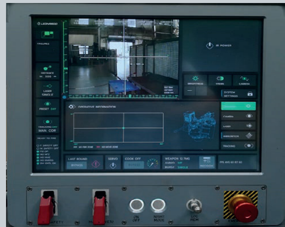
Local Control Panel

(²): Valid for cooled sensor, uncooled one is available too.