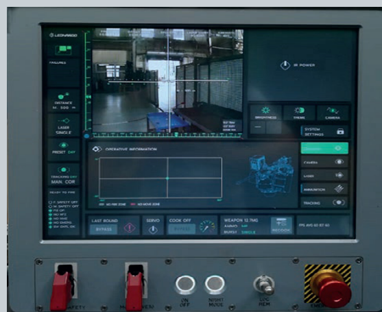
Local Control Panel

(²): Valid for cooled sensor, uncooled one is available too.