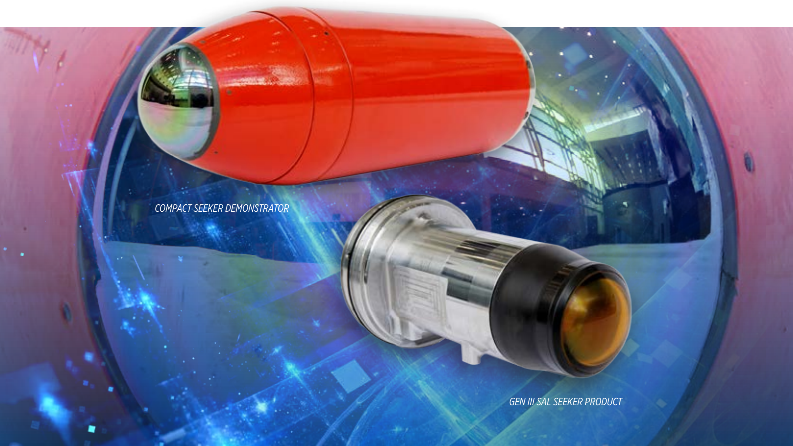
COMPACT SEEKER DEMONSTRATOR

Under a UK Government research initiative with additional investment, a new ground-breaking compact seeker demonstrator has been designed and manufactured. This innovative seeker solution has been designed to meet a wide variety of requirements from future battlefield and short-range air defence weapons. Management of unit production price is a critical requirement in these sectors, and the design has been developed from the outset with this aspect in mind.