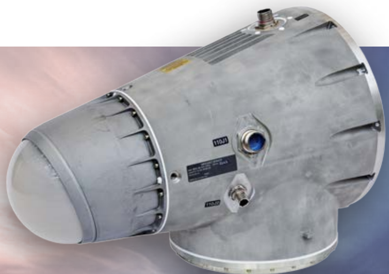
Storm Shadow / Scalp EG I2R Seeker

The Company is a world leader in airborne RADAR and is heading the European consortium developing RF AESA technology to upgrade the current air platforms. The Precision Guidance business is the primary contact for exploitation of companywide technologies in guided weapon programmes.