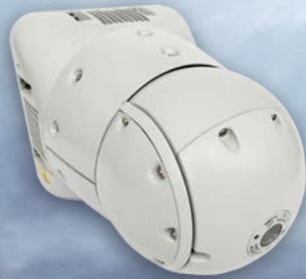
Loitering Munition Dual Mode Seeker