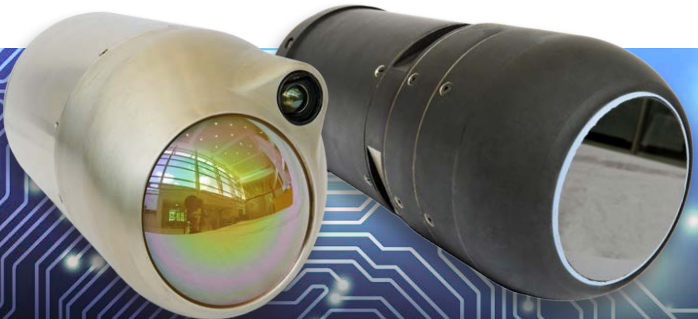
DUAL MODE I2R/SAL SEEKER DEMONSTRATOR

Leonardo recognises that in order to develop mutually beneficial business opportunities in export markets, technology transfer can be an important mechanism. As a company we are open to discussions on this type of collaboration provided that it is structured within a viable overall business framework that offers realisable benefit to our company. Export approvals for collaborations are administered through the Export Policy and Assurance (EPA) department within the UK Ministry of Defence (MoD).