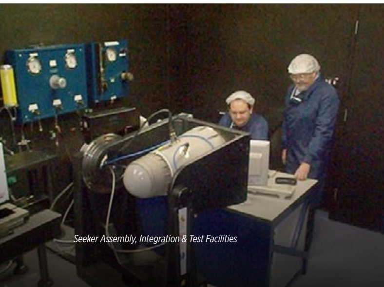
Seeker Assembly, Integration & Test Facilities

More recently the advances in EO seeker technologies within Leonardo have provided the opportunity to develop dual and multi-mode sensing capabilities within a single missile seeker.