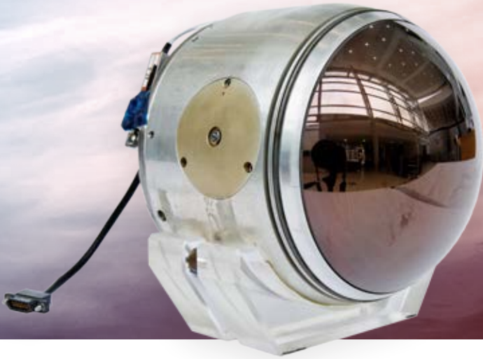
Javelin I2R Seeker

The commencement of development for a Loitering Munition led to the requirement for a dual mode EO seeker with I2R and low light TV sensor performance. Leonardo successfully completed the seeker development within record timescales and achieved the first UK application of uncooled LWIR technology in a missile system.